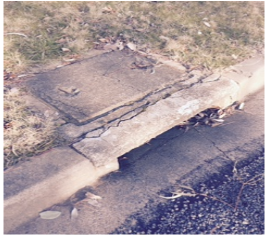
Photo 3- Crack on the kerb and gutter