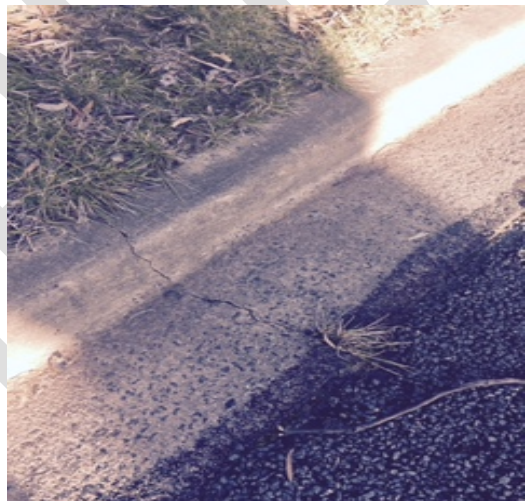
Photo 4 - Cracked verge crossing