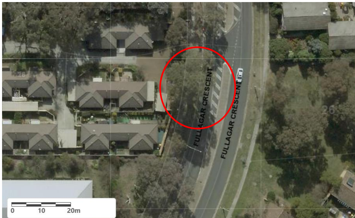
Location of Eucalyptus blakelyi RT1135 in Higgins