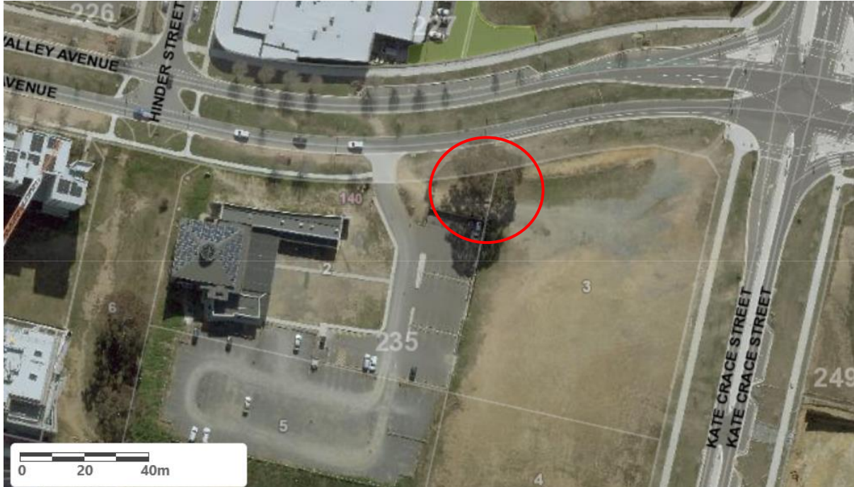
Location of Eucalyptus melliodora RT1159 in Gungahlin