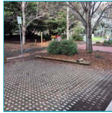
EDDISON PARK BOLLARD