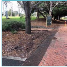
EDDISON PARK BOLLARD1