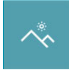
CUSTOMER ENTRY (AUTO NOTE)