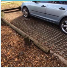
EDDISON PARK BOLLARD2