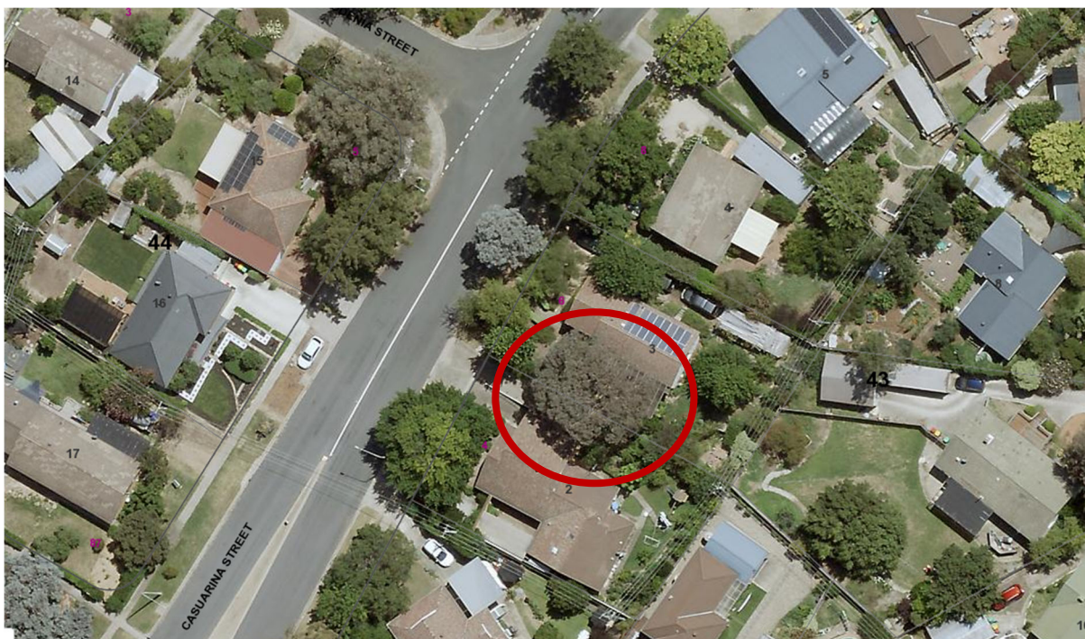
Location of Eucalyptus polyanthemos RT1074 in Rivett