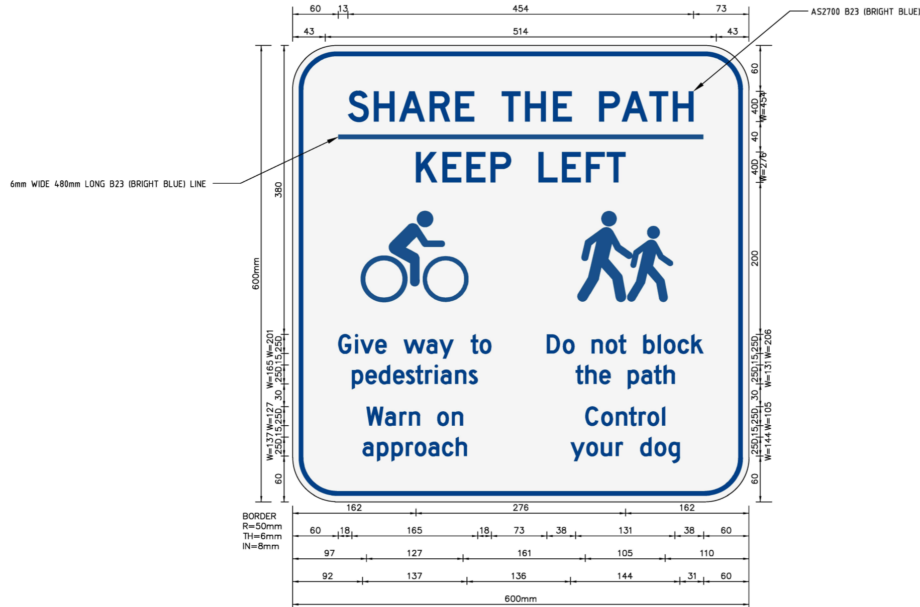
GC-50 MAIN COMMUNITY ROUTE BEHAVIOURAL SIGN