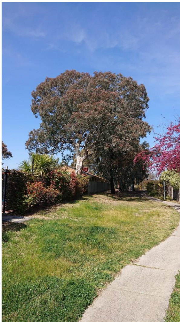
Photo of the tree

Location: Rear of 10 Mt Vernon Drive, Kambah