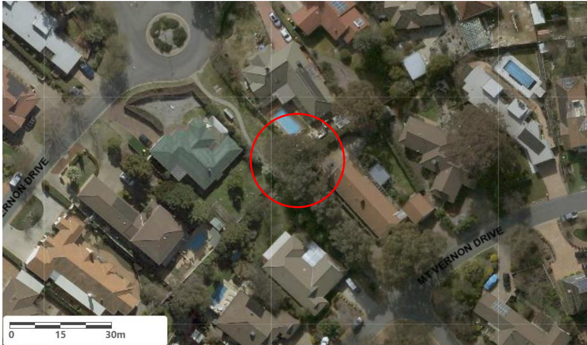
Location of Eucalyptus melliodora RT1150 in Kambah