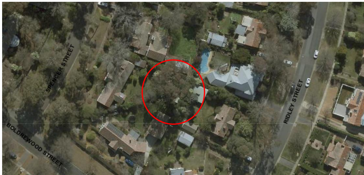
Location of Eucalyptus blakelyi RT1133 in Turner