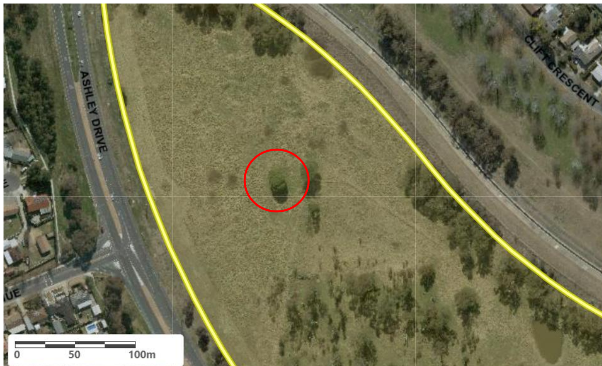
Location of Pinus halepensis RT1142 in Richardson