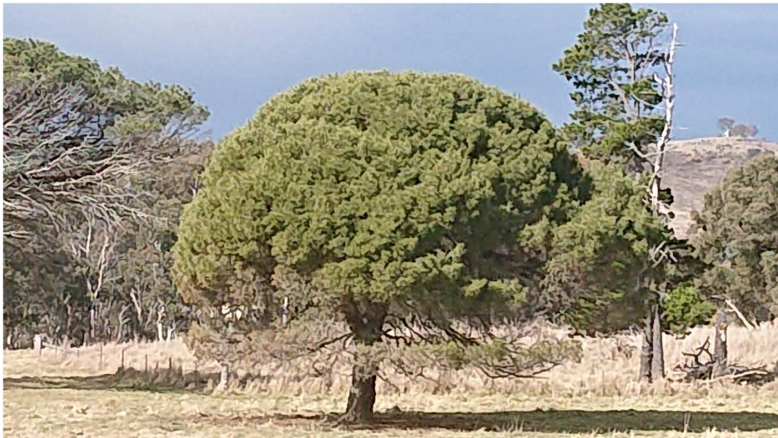
Photo of the tree

Location: 130 Johnson Drive, Richardson - Block 1 Section 450