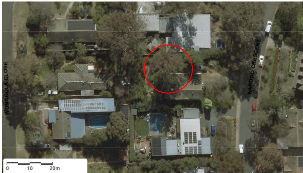
Location of Eucalyptus melliodora RT1161 in O'Connor