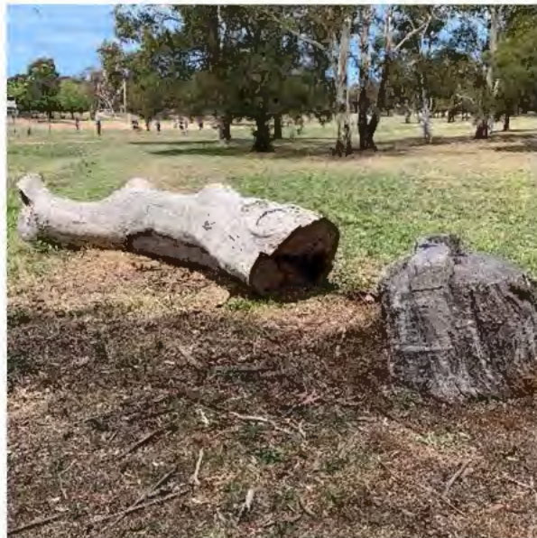
Image one Trunk and stump Nov 2018.

██████████ Pty Ltd was asked to inspect the scar tree at Wanniasa and advise on its safe movement to a storage location. Recommendations in this report are to safeguard the tree trunk and stump only. We have made no comments about safe work procedures. This is the responsibility of the parties involved in the physical work.