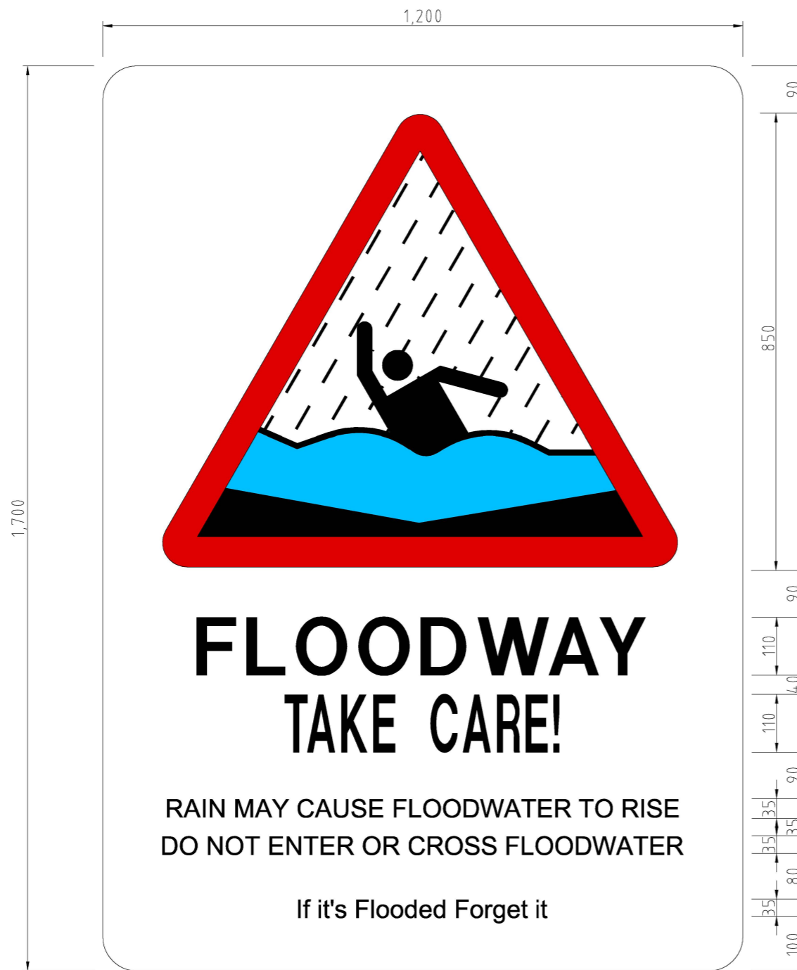
SIGN SIZE A