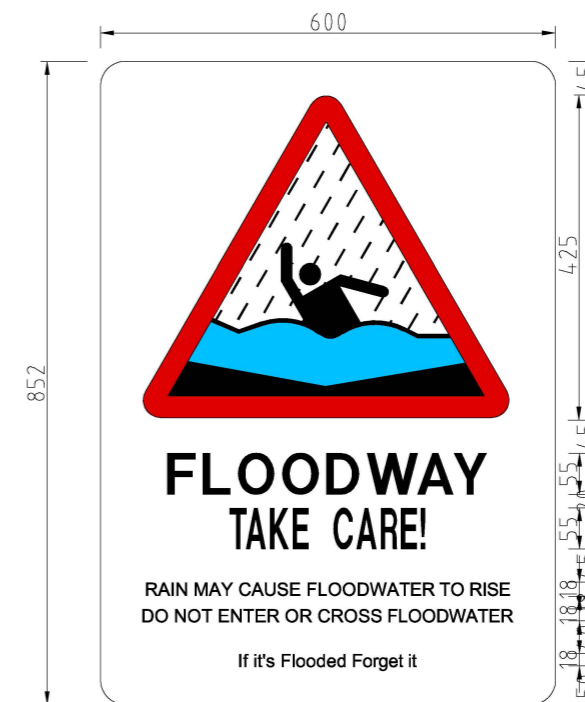
SIGN SIZE B