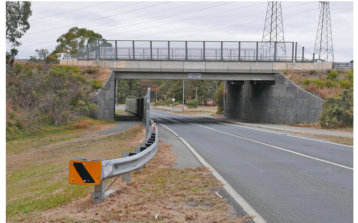
Constructed example of a road underpass for equestrian trail, trunk path and roadway. Gungahlin Drive overpass of Ellenborough Street, Kaleen.