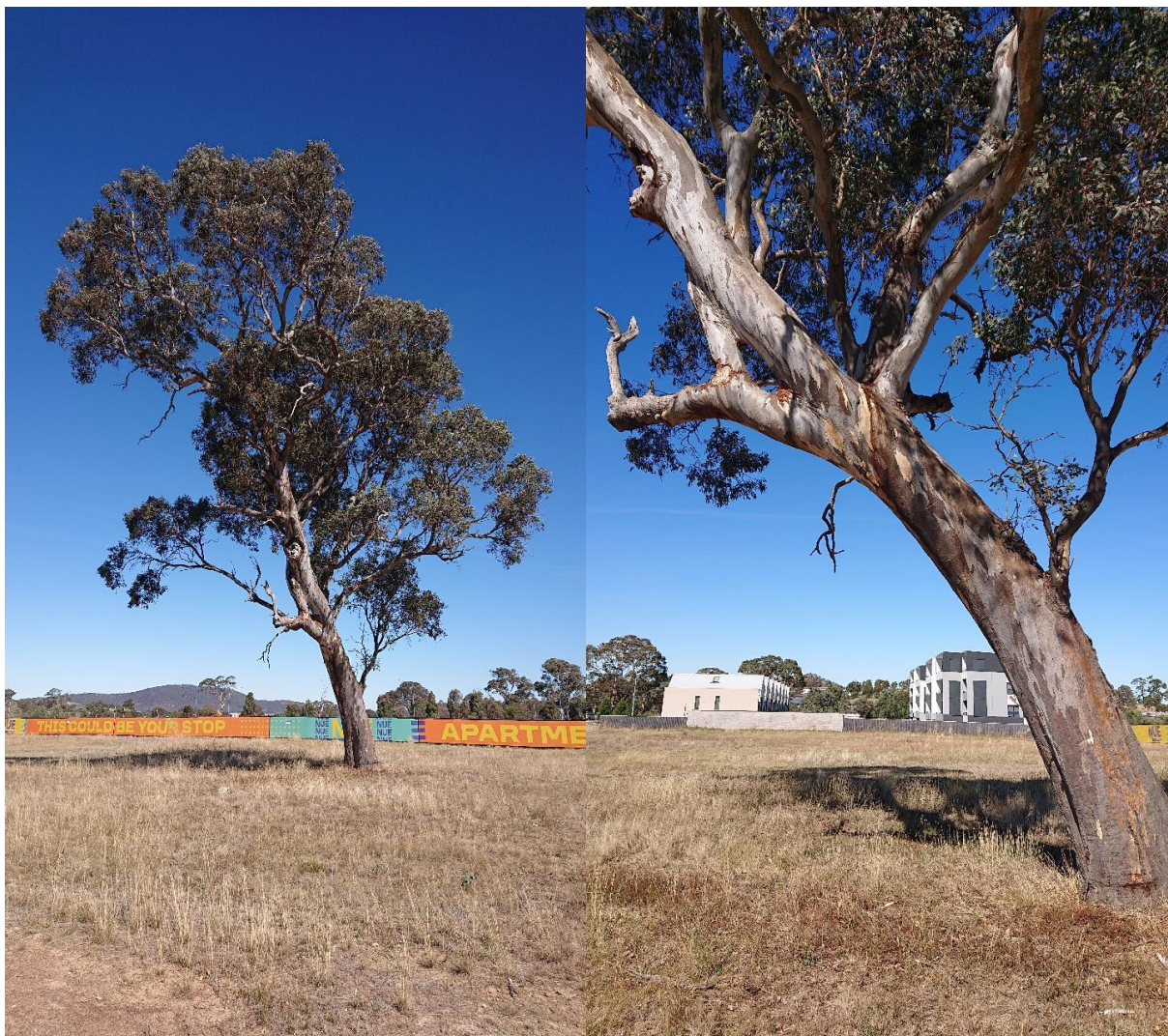
RT1119 Block 11 Section 240, Gungahlin - Eucalyptus blakelyi