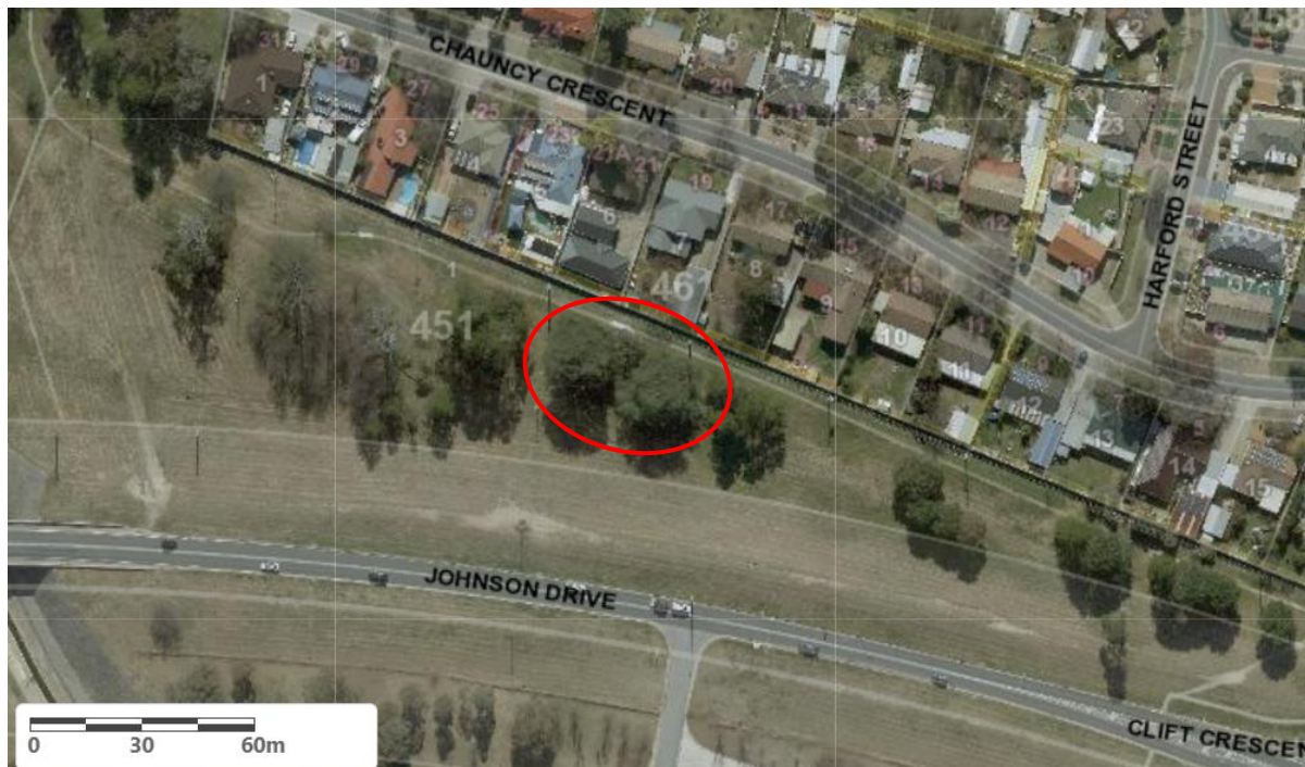
Location of 2 x Cedrus libani RT1146 in Richardson