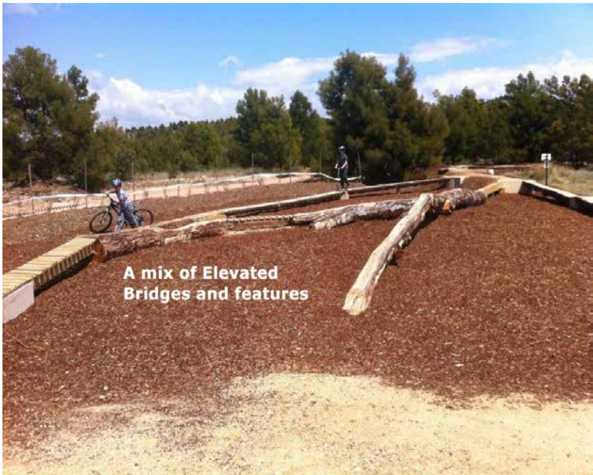
A mix of Elevated Bridges and features