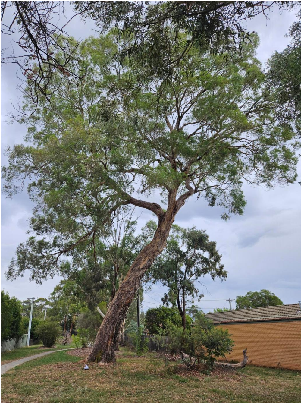
Eucalyptus melliodora RT1250 Kambah

Location: PRZ1: Urban Open Space – Crozier Circuit Connectivity Corridor