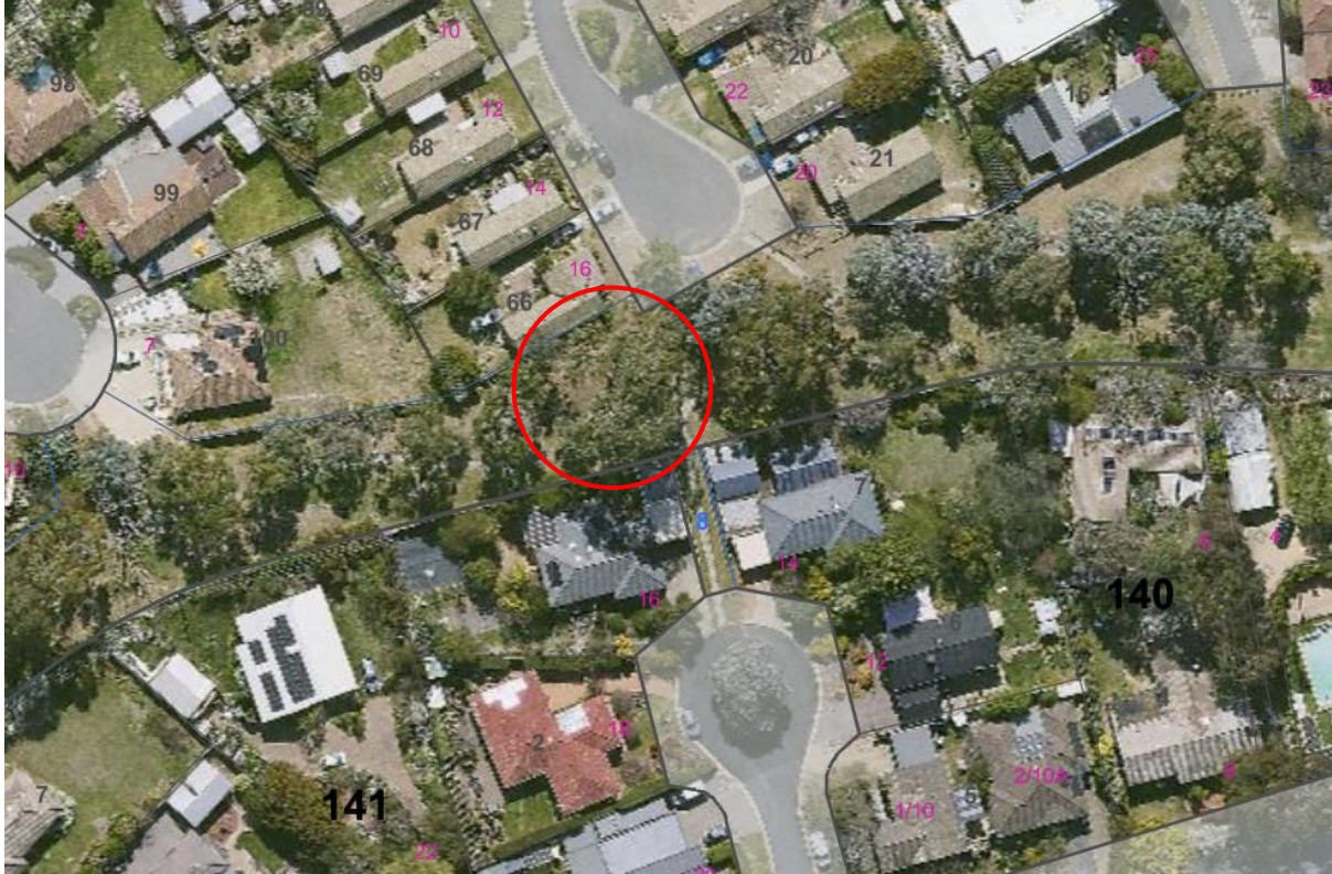
Location of Eucalyptus melliodora RT1250 in Kambah