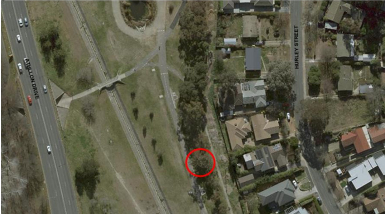
Location of Eucalyptus blakelyi RT1125 in Mawson