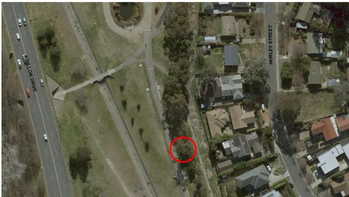
Location of Eucalyptus blakelyi RT1125 in Mawson