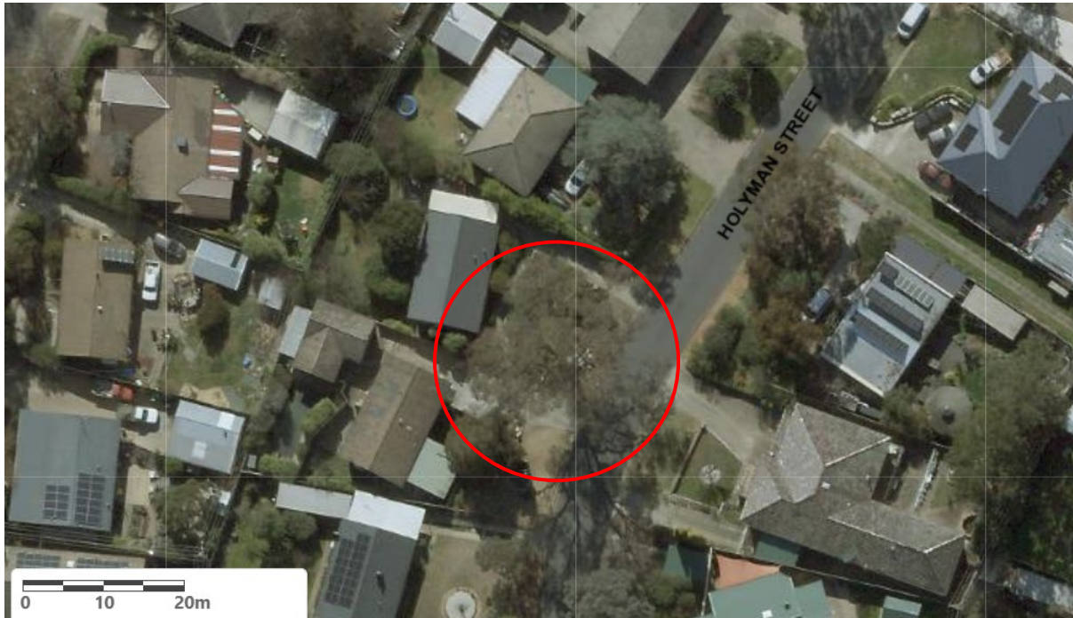
Location of Eucalyptus blakelyi RT1153 in Scullin