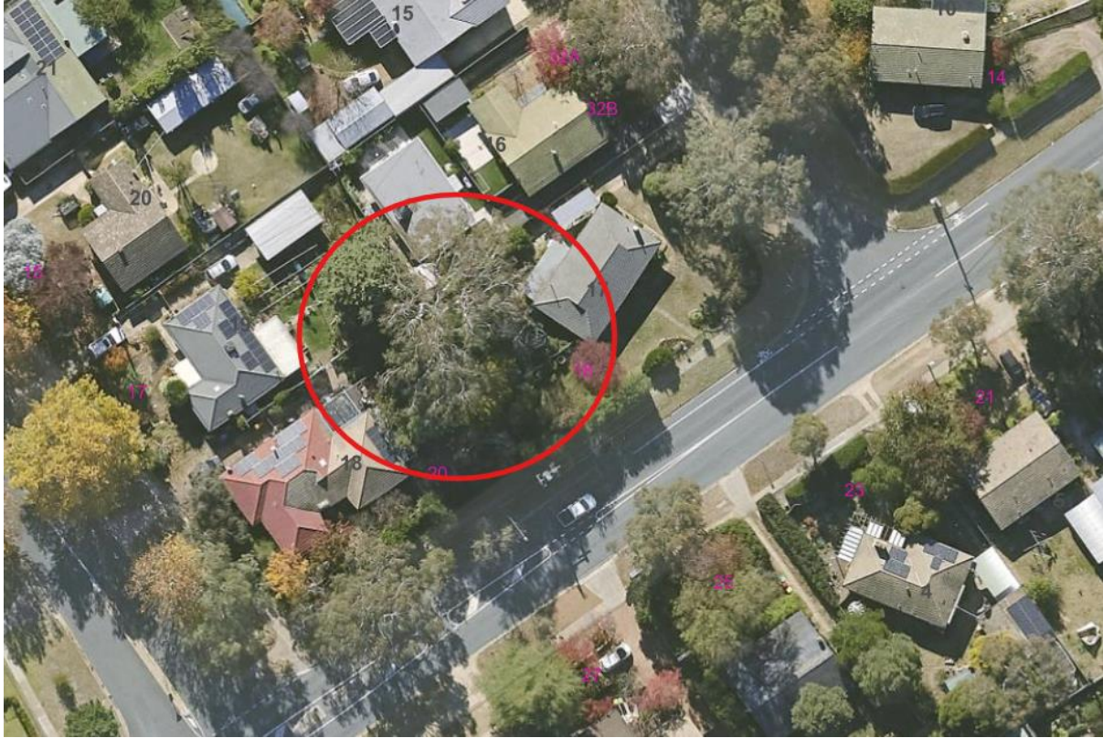
Location of Eucalyptus blakelyi RT1271 in Chifley