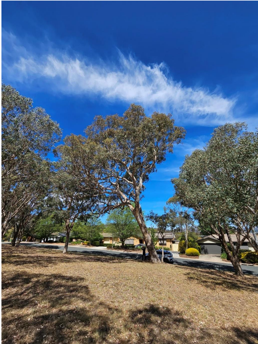
Eucalyptus polyanthemos RT1272, Wanniasa

Location: PRZ1 Urban Open Space Block 1 Section 250, Wanniasa