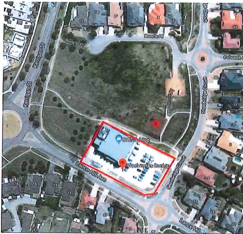
Figure 2: Dunlop local shops with the playground on adjacent public land shown as X .

Shade sails to be installed over the playground and a public notice board at the shops. Location of the public notice board to be identified in consultation with traders and leaseholder.