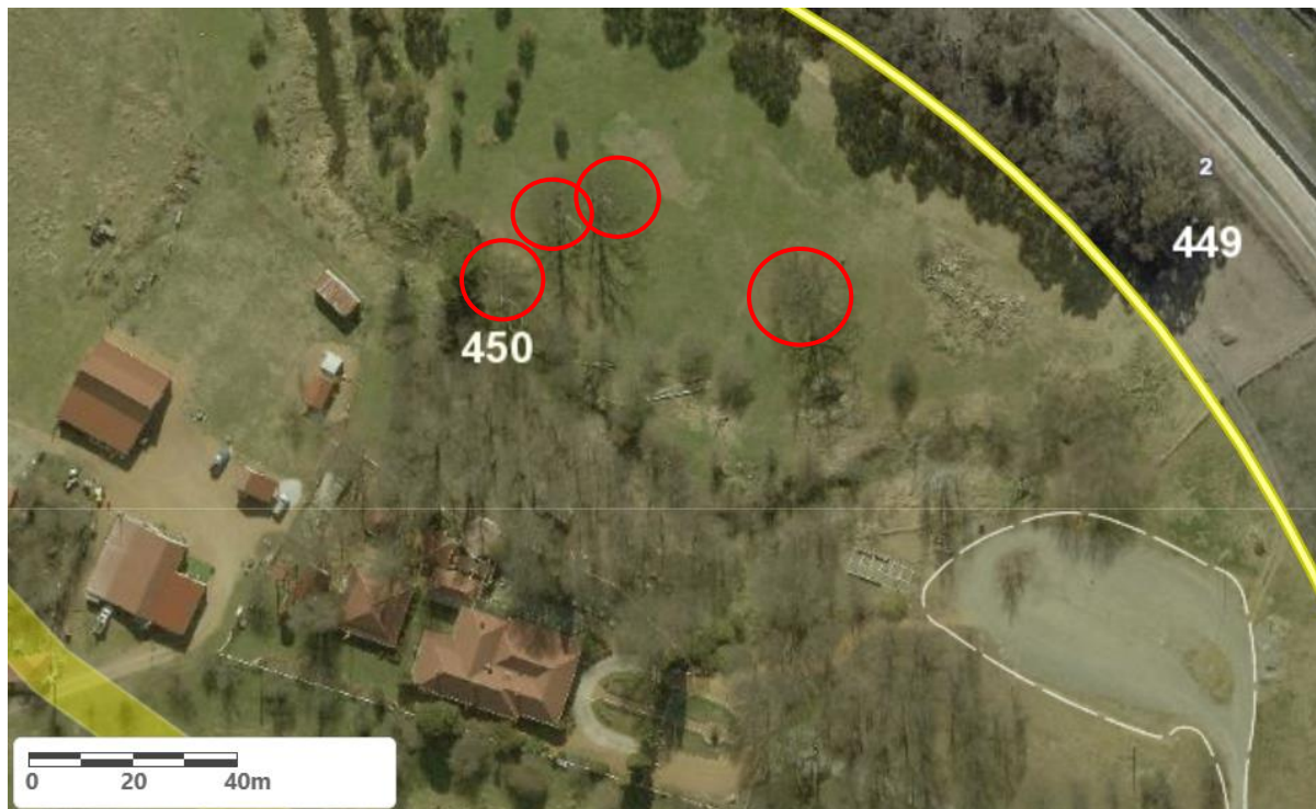
Location of Quercus robur RT1140 in Richardson