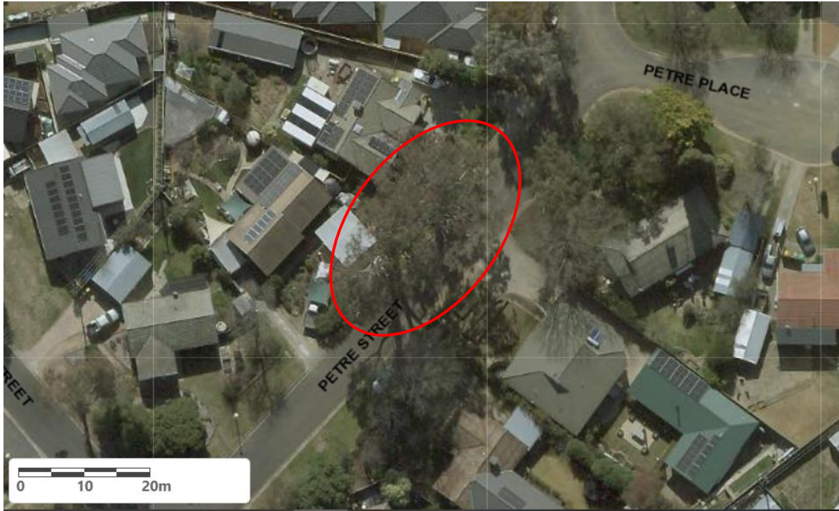
Location of Eucalyptus melliodora (Yellow Box) RT1137 Scullin