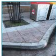
3 1SM JUN_29_2023