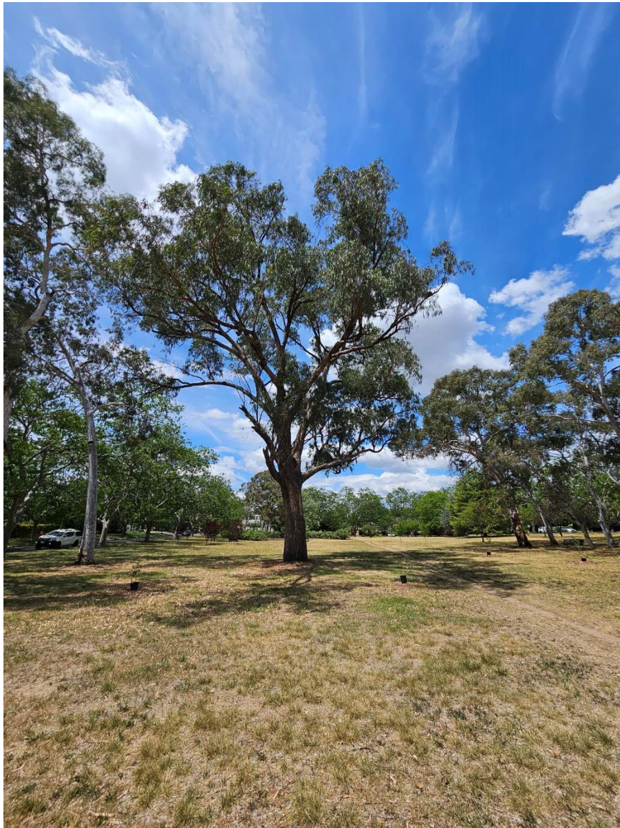
Photo of RT1242 Griffith Eucalyptus bridgesiana