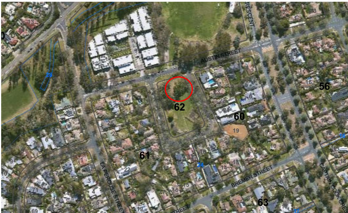
Location of Eucalyptus bridgesiana RT1242 in Griffith