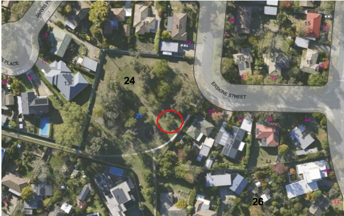
Location of Eucalyptus blakelyi RT1277 in Macquarie

Aerial image showing location of the tree