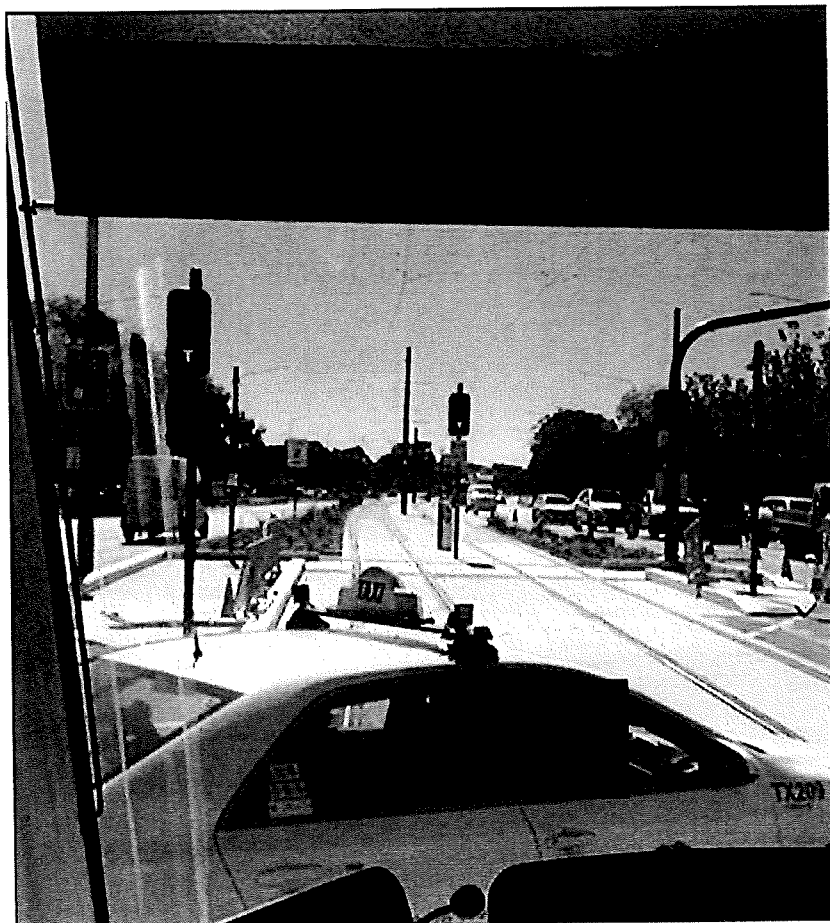
Photograph of taxi crossing tracks – Northbourne Ave