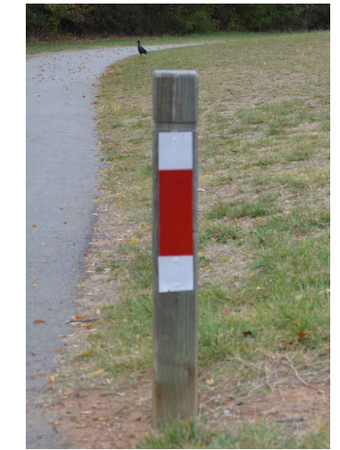
BOLLARD WITH REFLECTIVE TAPE ARRAY PATH EDGE ON ACCESS COMMUNITY ROUTE