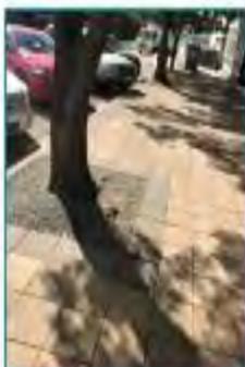
3 1SM APR_04_2023