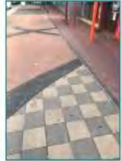
2 1SM APR_04_2023