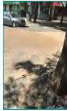
2 1SM APR_04_2023