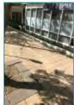
1 3SM APR_04_2023