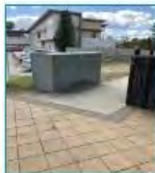
1 RM INVOICE INSPECTION OK 3/4/24