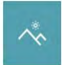
CUSTOMER ENTRY (AUTO NOTE)