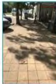
5 1SM APR_04_2023