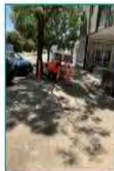
1 RM COMPLIANCE AND SAFETY INSPECTION 17/11/2023