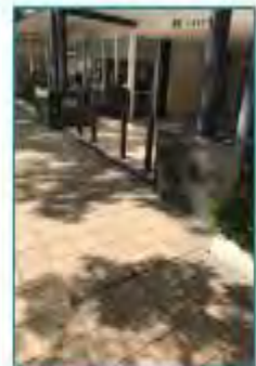
4 1SM APR_04_2023