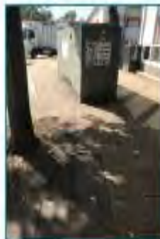
7 1SM APR_04_2023