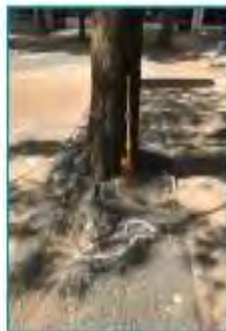
2 6M APR_04_2023