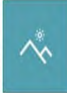
CUSTOMER ENTRY (AUTO NOTE)