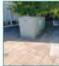
F19876C7-A58D- 47AE-84A3- 8AA260D810EA