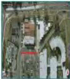
LOCATION- HARDWICK-CRES- HOLT