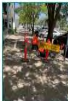
2 RM COMPLIANCE AND SAFETY INSPECTION 17/11/23