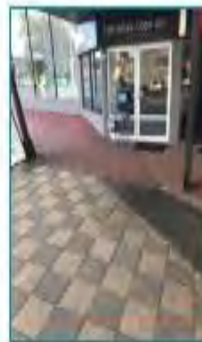
1 3SM APR_04_2023