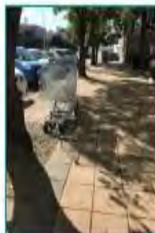
2 2SM APR_04_2023