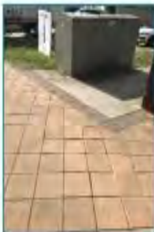
8 2SM APR_04_2023