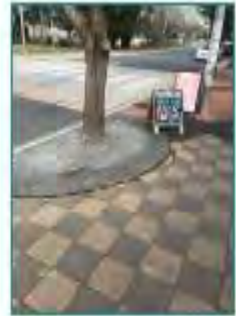
1 4SM APR_04_2023