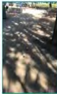
1 1SM APR_04_2023