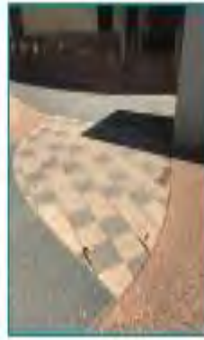
3 1SM APR_04_2023