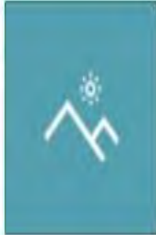
CUSTOMER ENTRY (AUTO NOTE)