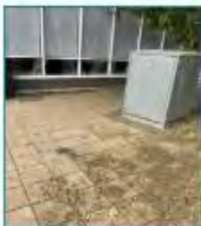
2 RM INVOICE INSPECTION OK 3/4/24