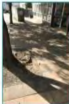
6 2SM APR_04_2023