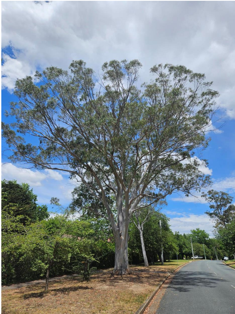
Eucalyptus racemosa RT1243 Forrest

Location: On the street verge adjacent 2 Tennyson Crescent, Forrest