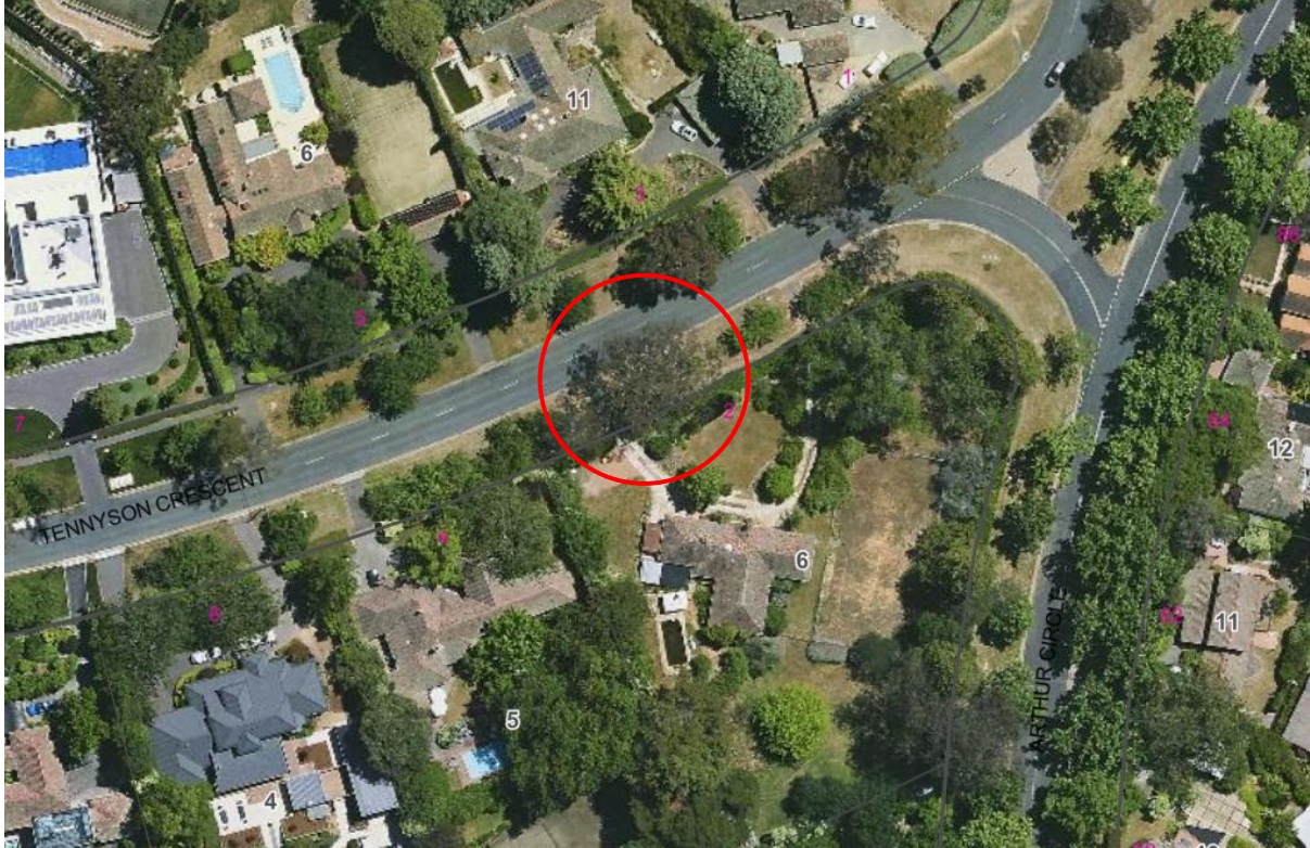
Location of Eucalyptus racemosa RT1243 in Forrest