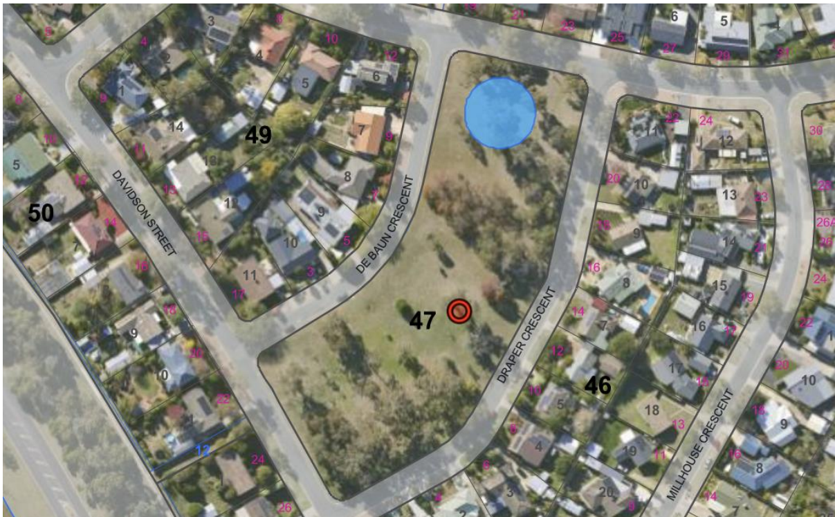
Location of Eucalyptus blakelyi RT1263 in Higgins in red