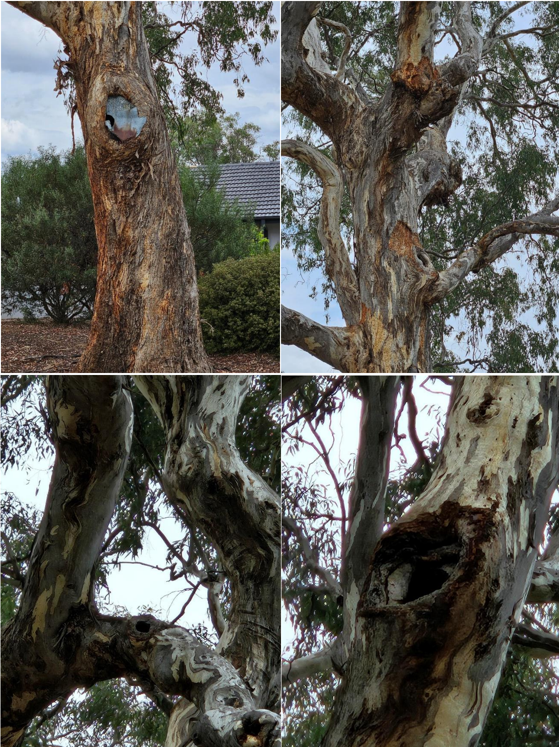
Photos of Eucalyptus melliodora RT1244 Hughes showing multiple tree hollows