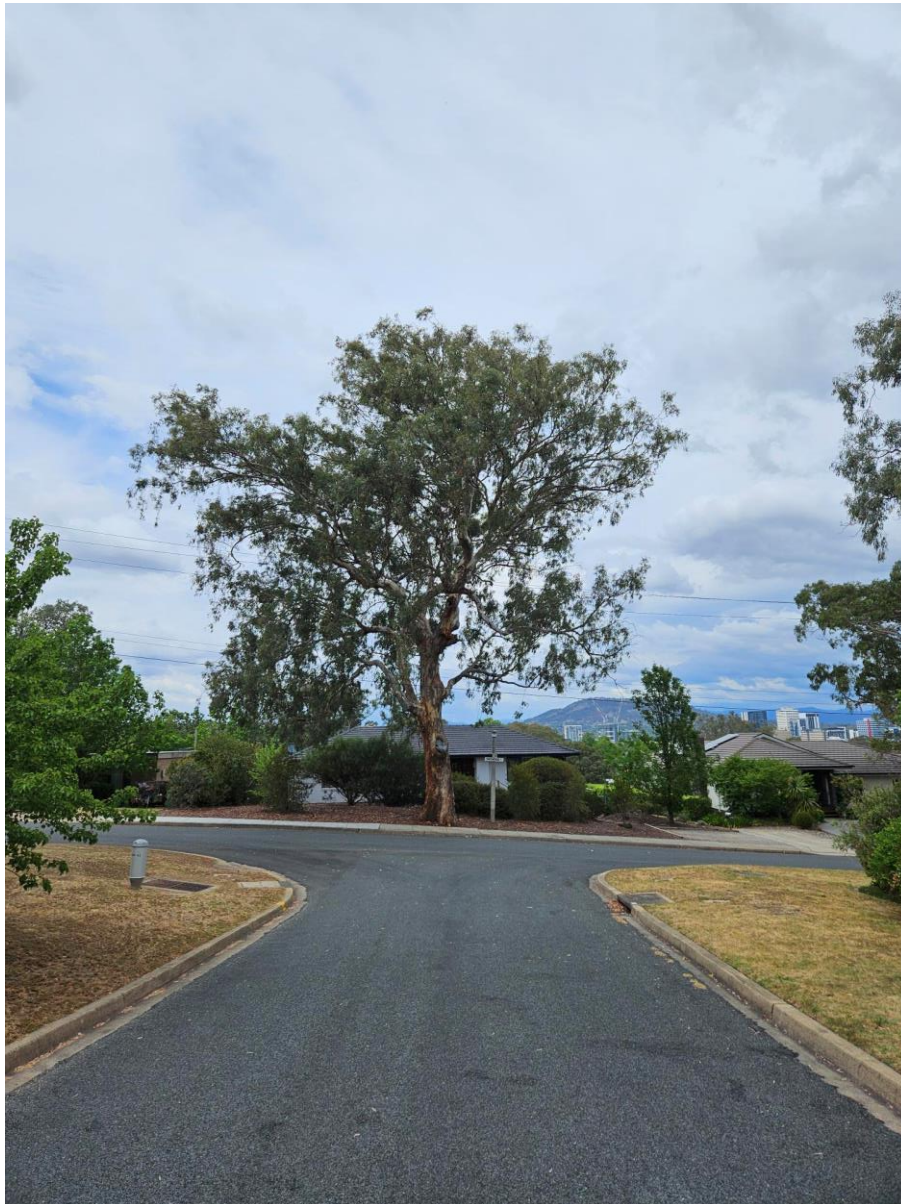
Photo of Eucalyptus melliodora RT1244 Hughes

Location: On the nature strip adjacent 30 Birdwood Street, Hughes