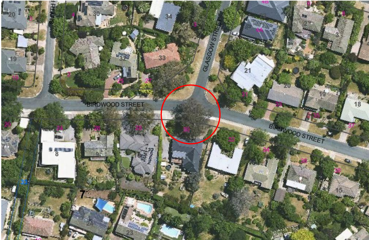
Location of Eucalyptus melliodora RT1244 in Hughes