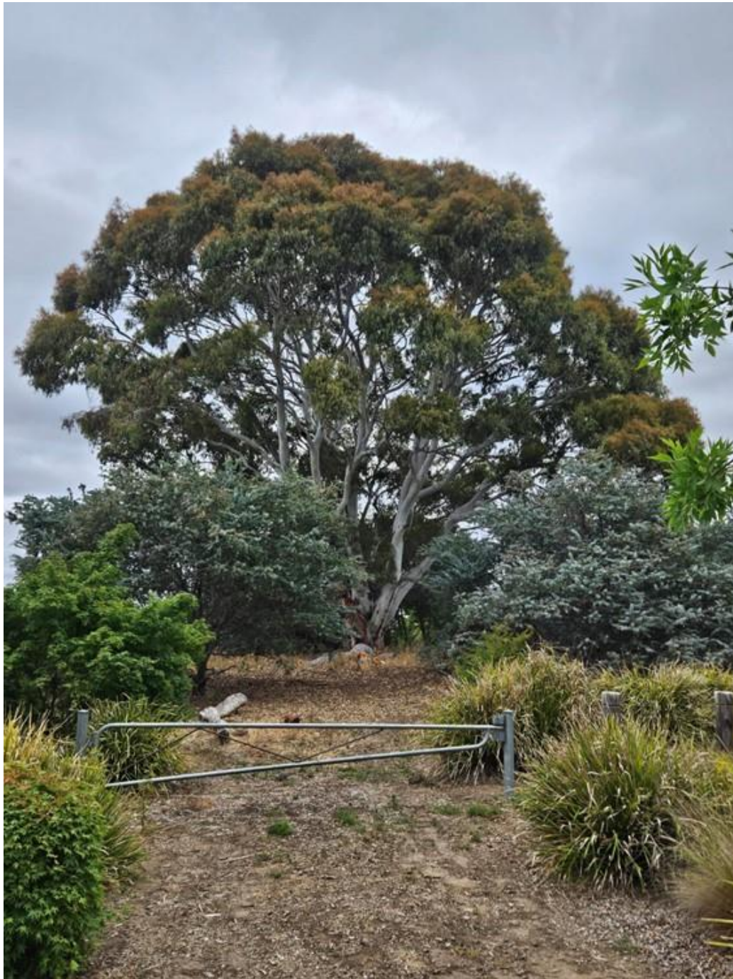
RT1270 Eucalyptus blakelyi in Macgregor

Location: PRZ1 Urban Open Space Block 44 Section 150, Macgregor