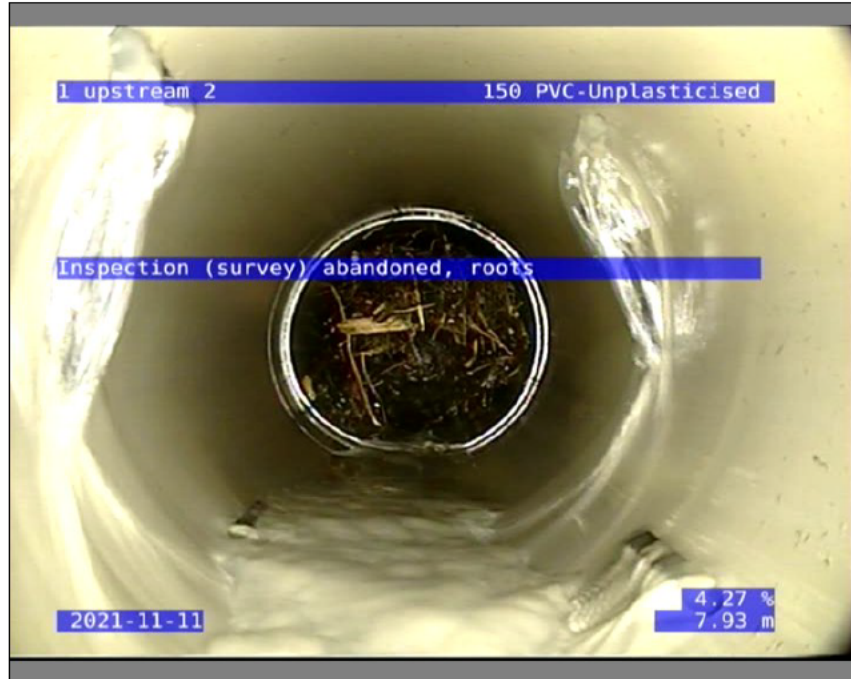
Photo: 1_1_3_A.JPG, 00:01:32 7.93m, Inspection (survey) abandoned, roots